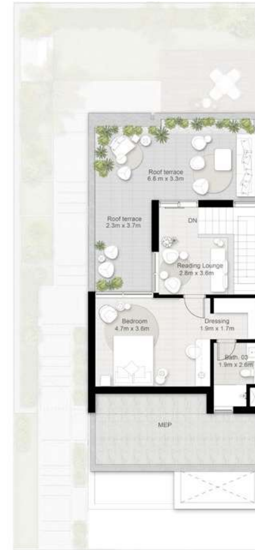
Option 2 – Entertain