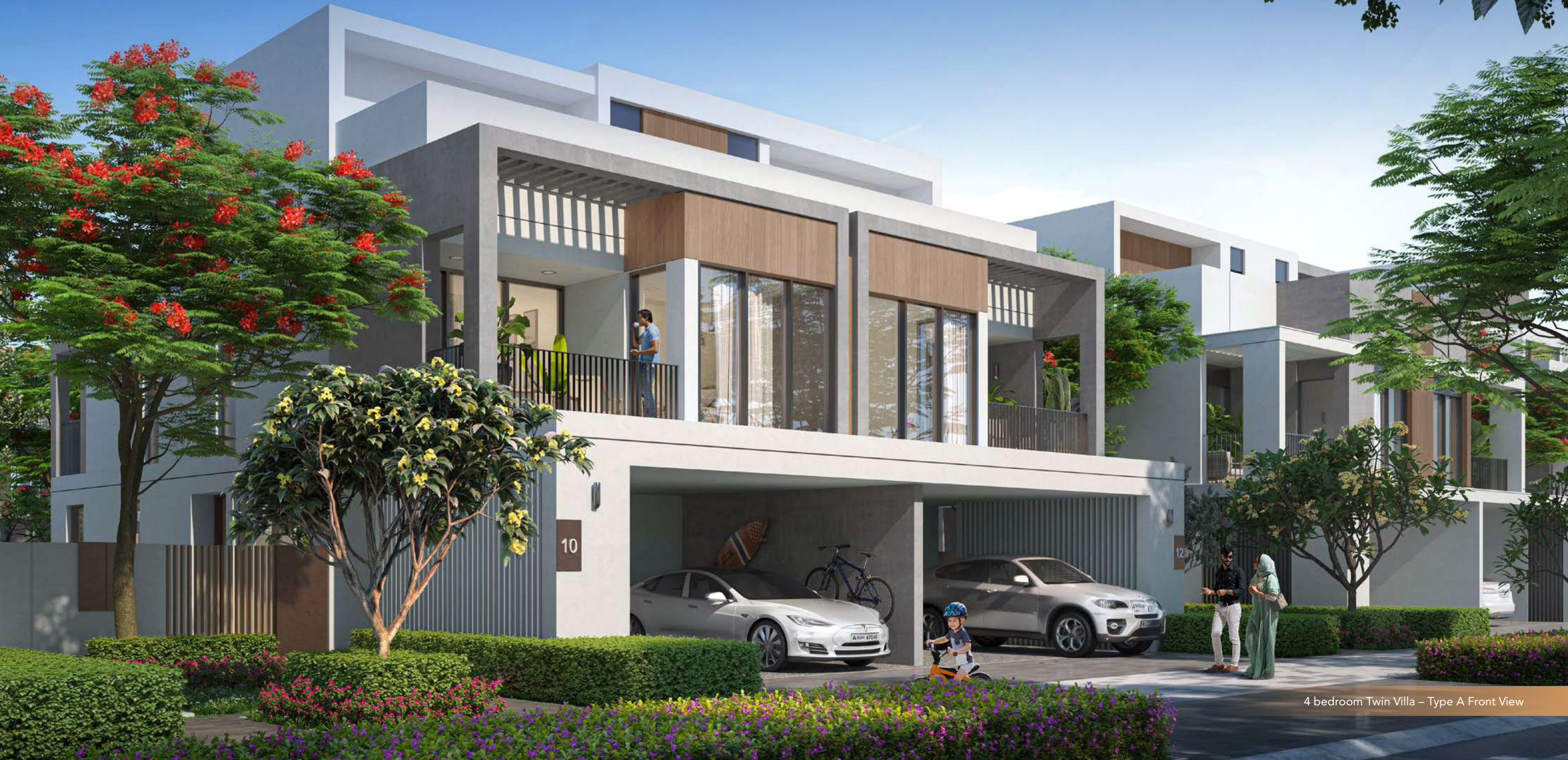
4 bedroom Twin Villa – Type A Front View