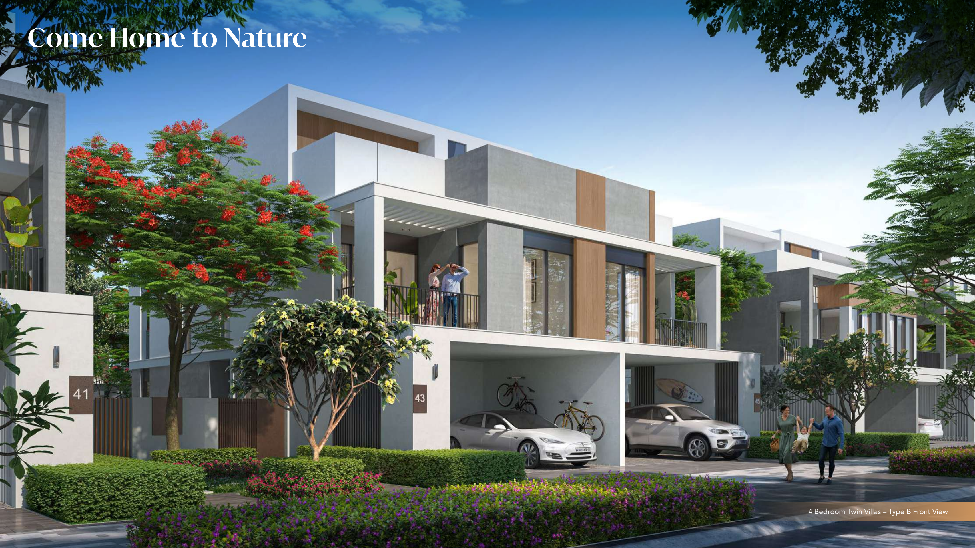
4 Bedroom Twin Villas – Type B Front View