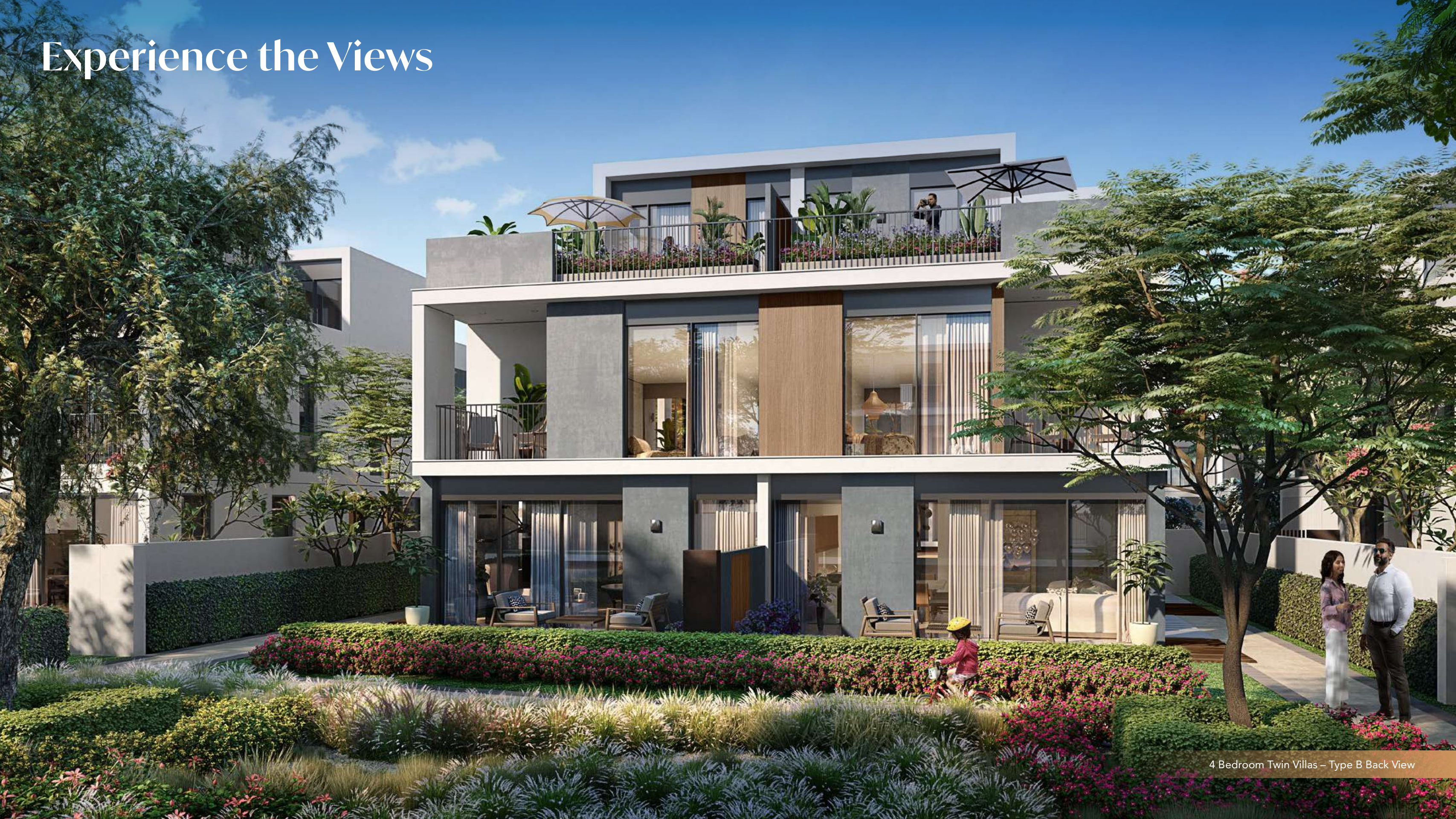
4 Bedroom Twin Villas – Type B Back View