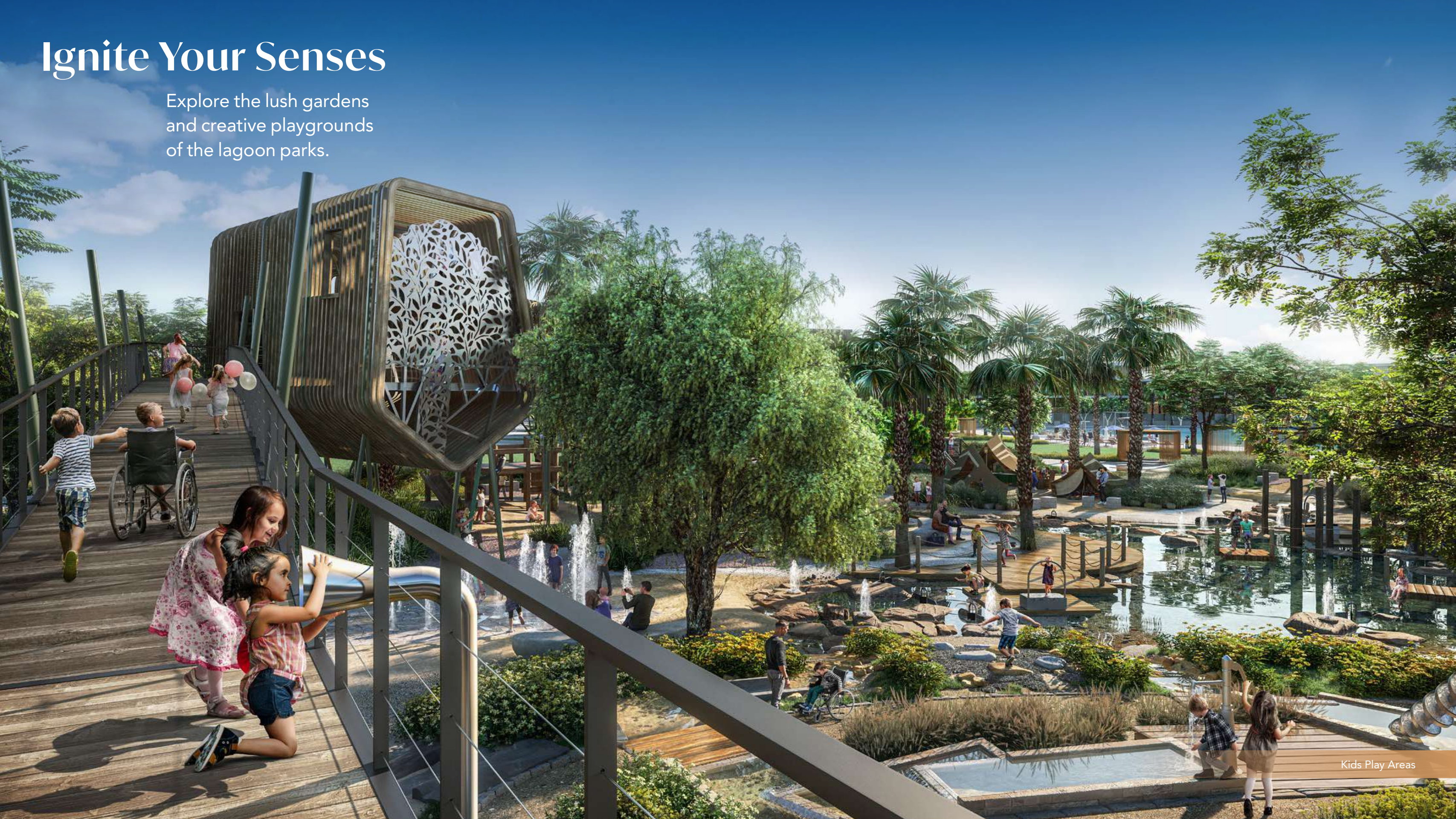
Kids Play Areas

Explore the lush gardens and creative playgrounds of the lagoon parks.