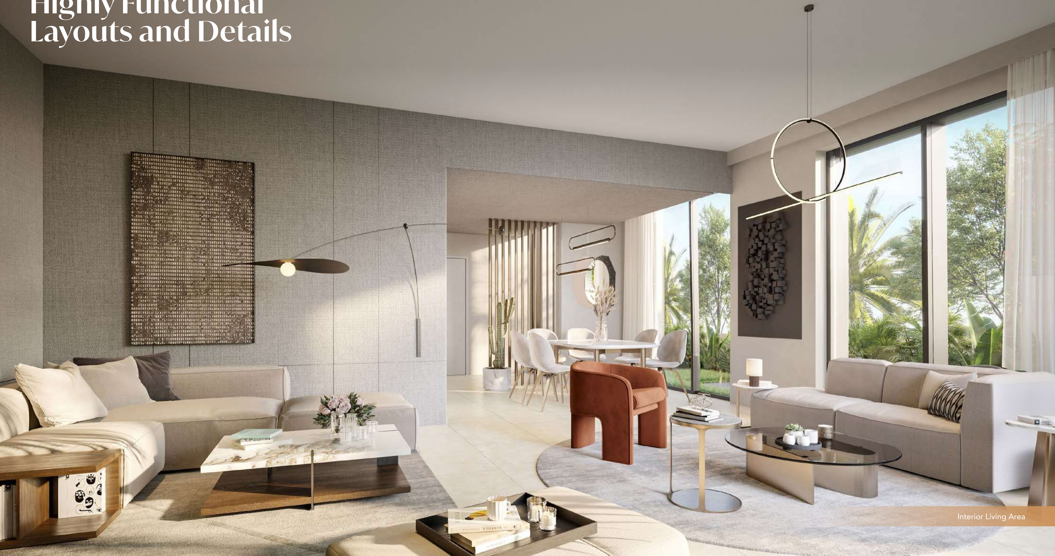
Interior Living Area